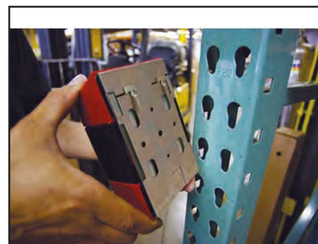
WAREHOUSE RACK MOUNT

Slides onto a mounting plate which is screwed into a wall, providing a semi-permanent installation.