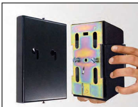
REMOVABLE (SEMI PERMANENT)

Easily and securely screw onto a wall or sturdy surface. The screws are concealed by end caps for discreet mounting.