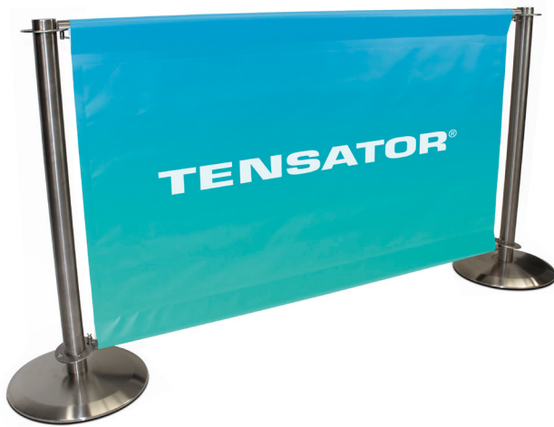
Tensator's Café Banners measure just under 1.5m from post centre to post centre (1330mm).