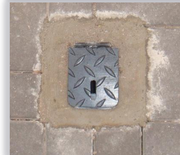
Base sits flush when not in use